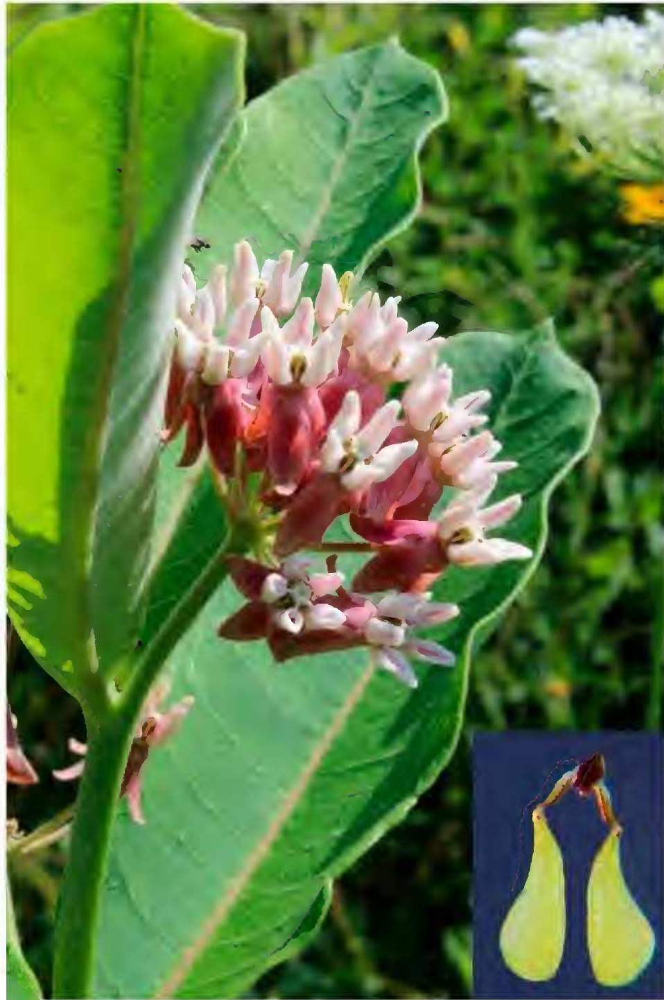
Figure 1. Asclepias syriaca x A. purpurascens . Hybrid flowers. Inset shows the pollinarium.